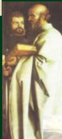
Jews in Palestine revolt against Rome, the first of three uprisings (70, 115, 135 AD).