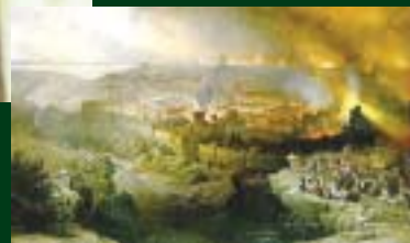
Jewish revolt fails and Jerusalem is destroyed.