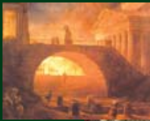
Great fire in Rome; Emperor Nero blames the Christians and widespread persecution begins.